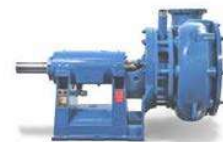
High Volume Froth Pump