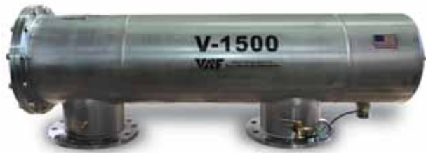
Horizontal Design for ease of installation