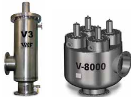
Vertical Design for minimal footprint