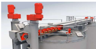
Shaftless Spiral Conveyor

Air Pollution Control Solutions for Sulfur, Hydrocarbons and Chemical