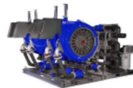
Rotary Fan Press