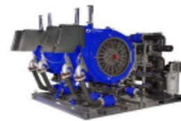
Rotary Fan Press