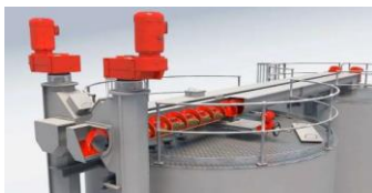
Shaftless Spiral Conveyor

Air Pollution Control Solutions for Sulfur, Hydrocarbons and Chemical